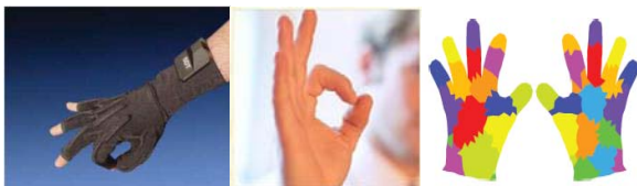
(a)Data-Glove based [21]. (b) Vision based. (c) Colored marker (from web gallery).

Color glove based approaches represent a compromise between data glove based approaches and vision based approaches. Marked gloves or colored markers are gloves that worn by the human hand [15] with some colors to direct the process of tracking the hand and locating the palm and fingers [15], which provide the ability to extract geometric features necessary to form hand shape [15]. The disadvantages are similar to data glove based approaches: they are unnatural and not suitable for applications with multiple users due to hygiene issues.